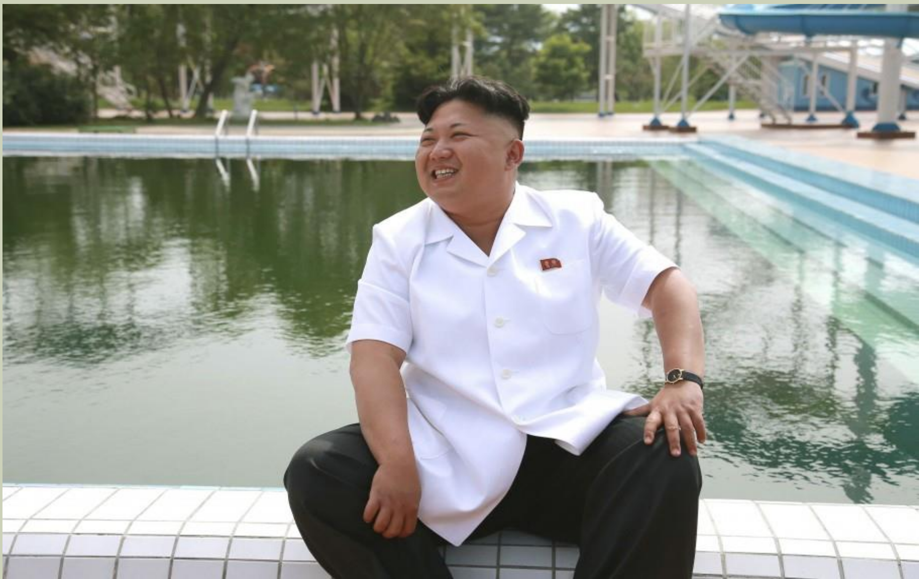
Caption: North Korean leader Kim Jong Un during a visit to the Songdownon International Children's Camp.

http://www.washingtonpost.com/blogs/worldviews/wp/2014/09/26/why-no-one-knows-whats-going-on-in-kim-jong-uns-north-korea/