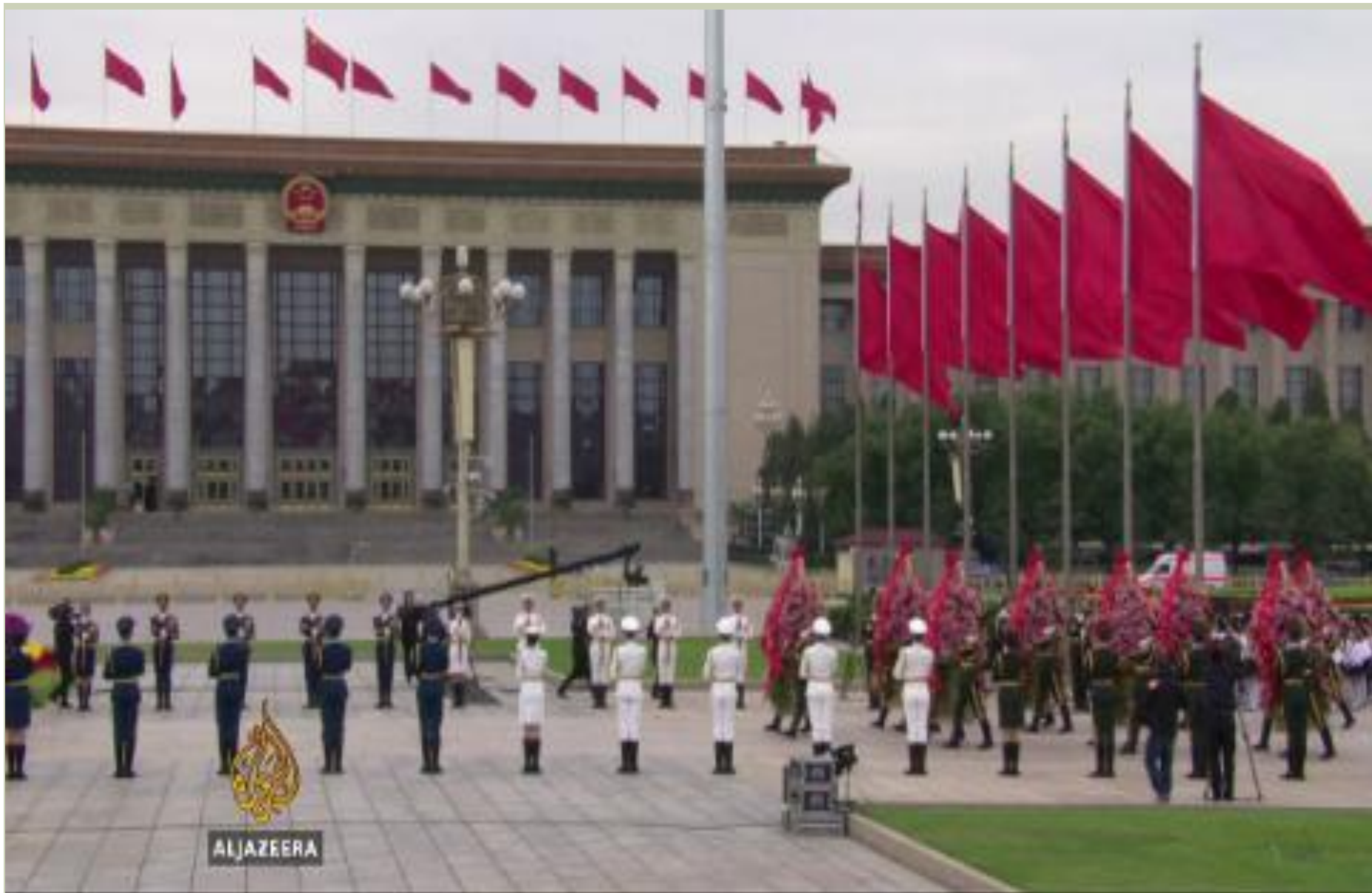
Caption: Muted celebration as China marks 65th National Day

China tells US not to meddle in Hong Kong. - Asia-Pacific . N.p., n.d. Web. 1 Oct. 2014. < http://www.aljazeera.com/news/asia-pacific/2014/10/china-tells-us-not-meddle-hong-kong-201410122107122567.html >.